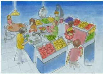
paulus design group